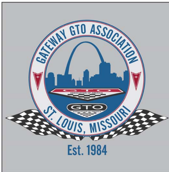
FULL BACK - 12" W x 10" H