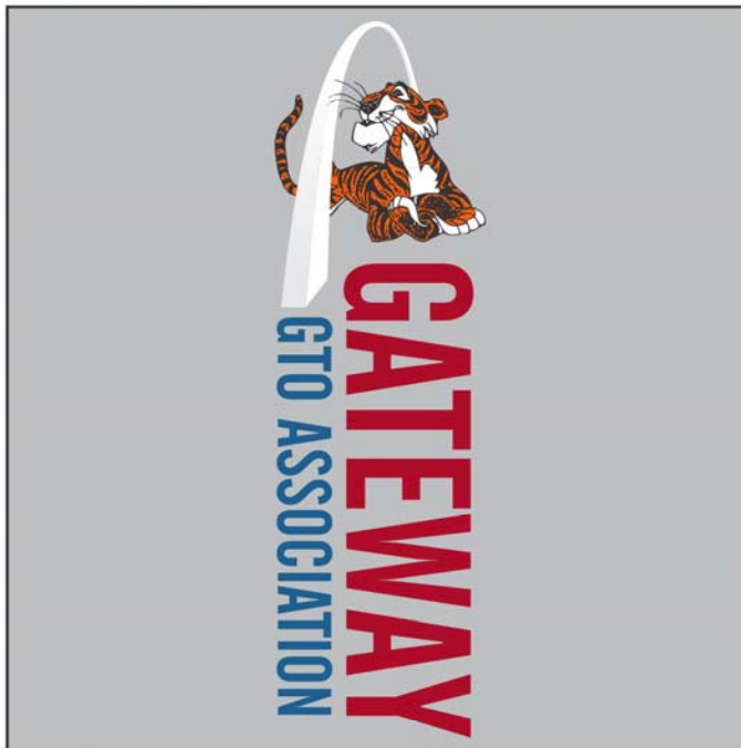
FULL FRONT - 4.5" W x 15" H